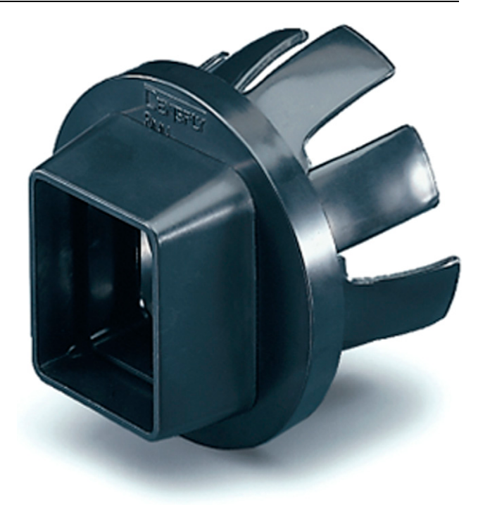
Figure 1 Rinn^{\text{(B)}} universal rectangular collimator (Dentsply Ltd, Addlestone, UK).

exposure. The cost of RC was determined from three different suppliers and was found to be approximately \in 100 . The fact that the use of RC can lead to loss of diagnostic information through cone cutting and that, in a certain percentage of exposures, this leads to retakes has not been incorporated in the calculations in this article.